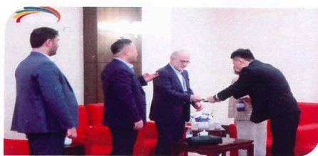
Special docking conference