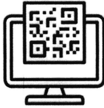
using a webcam